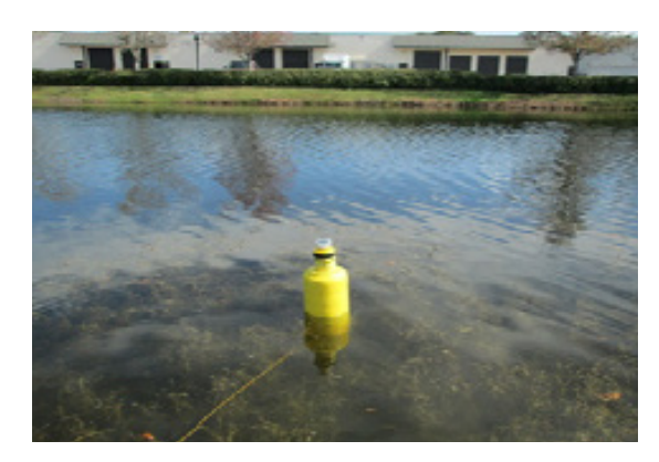
"EMM25 Buoy deployed in retention pond measuring DO" *Shown with optional beacon*